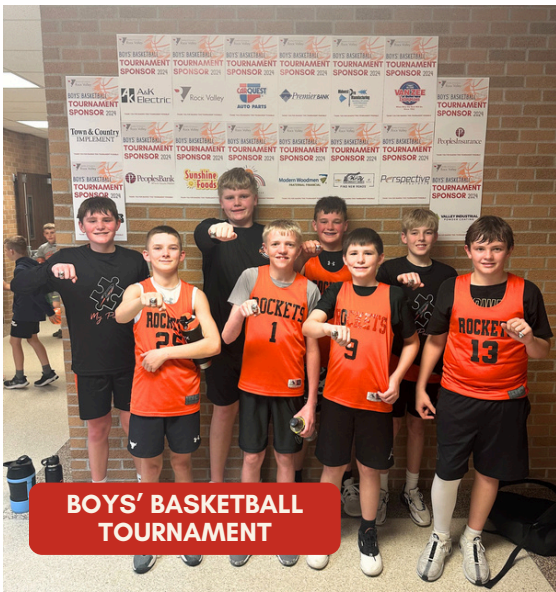
BOYS' BASKETBALL TOURNAMENT