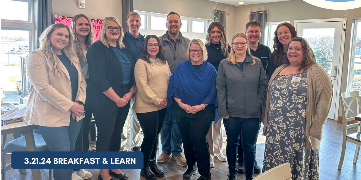
3.21.24 BREAKFAST & LEARN

97 Members in 2024 so far. 14 BRAND NEW!