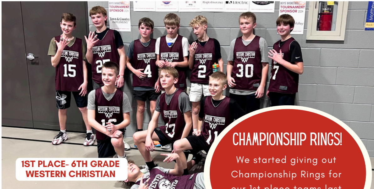
1ST PLACE- 6TH GRADE WESTERN CHRISTIAN