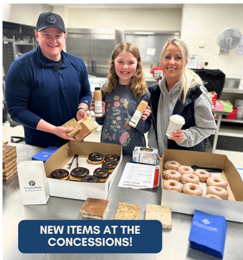
NEW ITEMS AT THE CONCESSIONS!